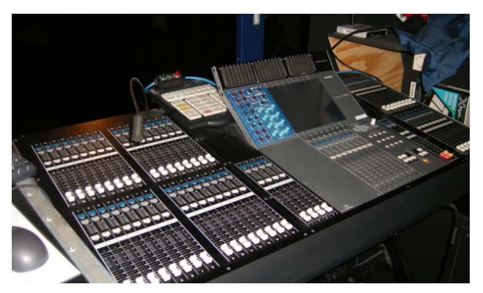
The sound mixer desk

Not that the income is particularly large. Nearly all the productions staged at the Arts are brought in, productions that are touring theatres around the country with a similarly sized stage. The theatre's share of the takings is 25%; if it's a popular show, with a starry cast, that figure is more likely to be 15–20%. Hence the booking fee, which goes in full to the theatre. I'll never complain again about being charged a booking fee.